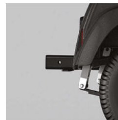
Rear Receiver Hitch