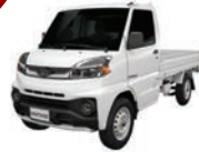
STD. CAB TRUCK

Comes with a 4-Speed Automatic Transmission, a first-of-its-kind.