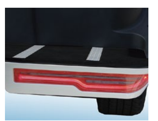
TAIL LIGHTS Tail lights include LED brake lights and LED turning signals.