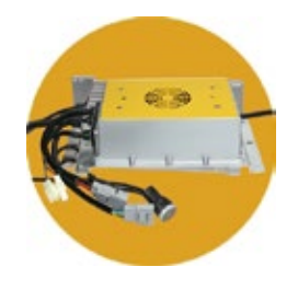
25A Adaptive Charger