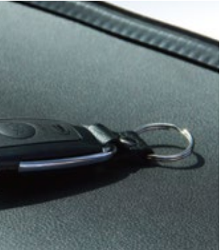
ELECTRIC KEY FOB

It allows you to press buttons to open the front trunk, accessing the