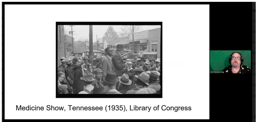
Medicine Show, Tennessee (1935)